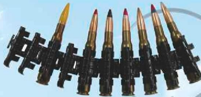
BELTS, XZ8 TYPE for .50 CALIBER MACHINE GUN