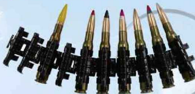
BELTS, XZ8 TYPE for .50 CALIBER MACHINE GUN