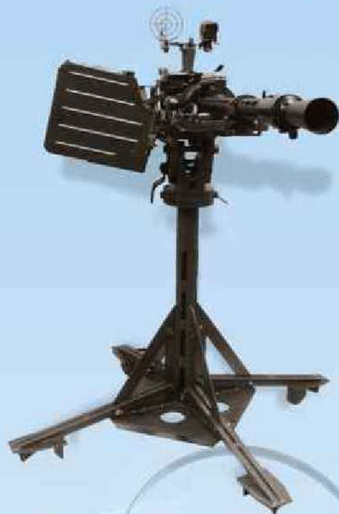
Cal. 14.5 x 114 mm MACHINE GUN ON T119 MULTIFUNCTION MOUNT WITH FOLDED LEGS FOR TERESTRIAL USE

I USE: 14.5 mm tank Machine gun is a powerful automatic weapons fitted to the armoured vehicles, military boats, mobile and stationary equipment. It is presented here on T 119 Vehicle (Boat) Mount. The mount can fold the legs and can be used on the ground. Designed to combat the lightly armored targets, fire power and manpower of the enemy, located behind the light shelter at ranges up to 3000. For shooting against ground and air targets cartridges are used with armour-piercing incendiary bullets API, armour-piercing tracer bullets API-T and other types of bullets such as BALL, AP, T, APT, HC-API.